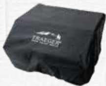
GRILL COVER - SCOUT/RANGER SKU: BAC457 Side zip pocket for easy storage of portable BBQ Multi-Tool Kit