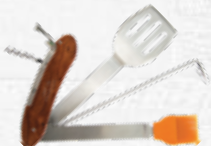
BBQ MULTI-TOOL KIT SKU: BAC461 Features BBQ Spatula, Pig Tail, Basting Brush, Wine Opener Tool - all in compact size